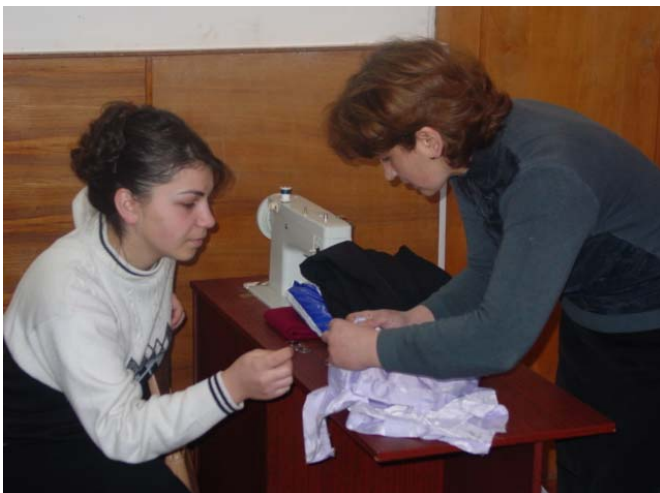
An instructor demonstrating sewing skills to a refugee girl at the Erebuni Community Centre, which was purchased with funds raised in Sydney and Los Angeles.

However, we now face an even greater need. Mission Armenia's major donor, USAID, has announced that it is ending its funding of medicines. This means that, as of January 1, the supply of medicines for the elderly under