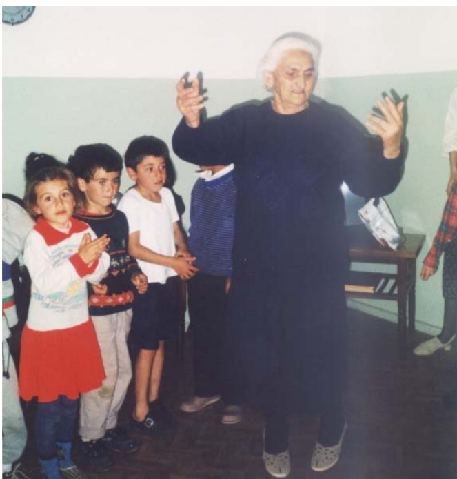
An elderly lady teaching schoolchildren Armenian dancing.